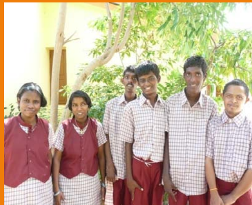
Mentally challenged destitute children in DSI