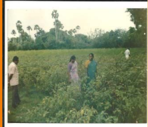
DSI Site - 1995

During holiday seasons we arrange short Picnics and Tours for children. DSI is an inter-religious organization and hence all the festivals such as Pongal, Diwali, Bakrid, Christmas along with national festivals are celebrated.