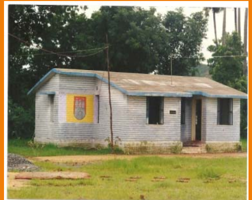
HAMBURG HOUSE – First cottage built for kids in DSI