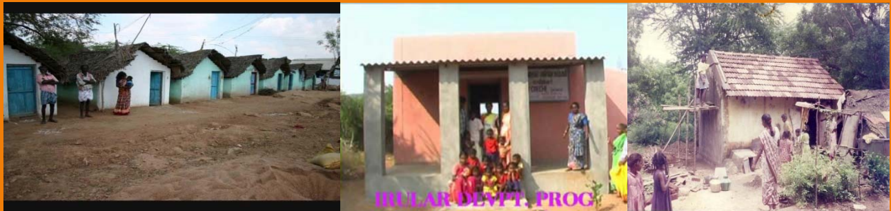
(Left) Group house – Thirumukoodal, (Middle) Creche at Madur, (Right) Reconstruction of houses at Mallalinatham

DSI facilitate community development projects in Irular village like Kollamedu, Madhur, Malalinatham. Some of the projects are Herbal Garden at Kollamedu, provision of bore well, reconstruction of houses at Malalinatham, providing free land for living for landless people of Irular community.