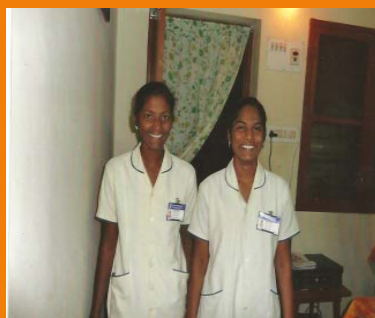
Nursing children from DSI Home

After finishing the schooling, children who desire to do higher education are given opportunity to do professional courses such as nursing, teacher's training, polytechnic, automobile technical course and to obtain graduate degree in arts, science and engineering. The higher education of the children in DSI are supported Bijou-Brigitte.