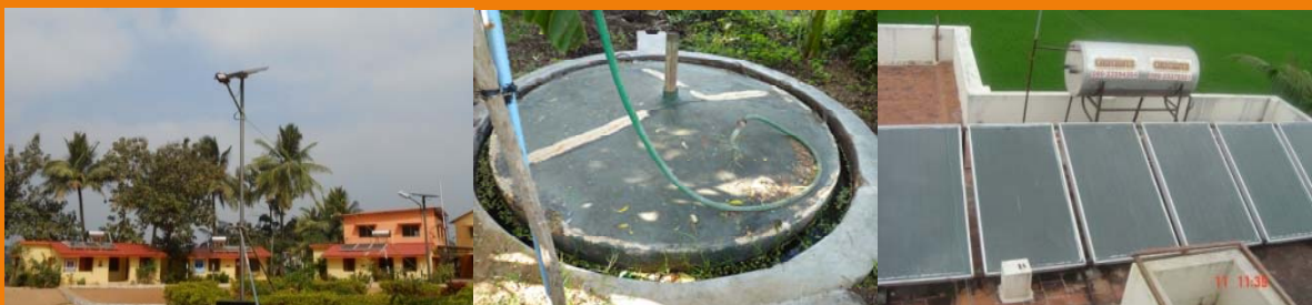
(Left) Solar lamp post installed at DSI Home, (Middle) Bio-gas behind the DSI Crèche, (Right) Solar water heater installed at DSI Home

At present we use solar energy for light & fan in both homes. We used solar for heat water also. We have a bio-gas plant to supplement fuel for cooking. Further we have to install more solar equipment.