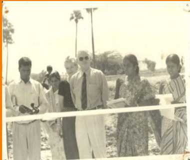
German consulate at Chennai during the inaugural ceremony of DSI when it was started