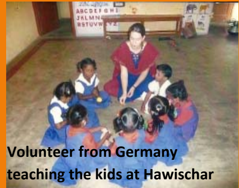
Volunteer from Germany teaching the kids at Hawischar Primary school