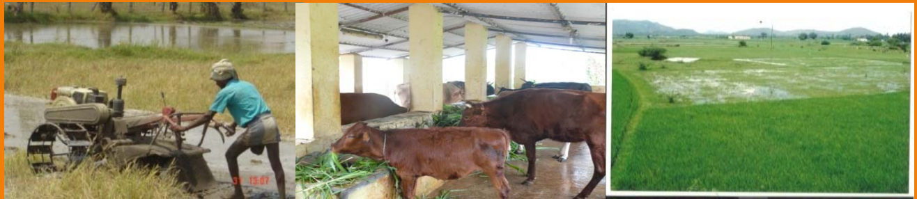
(Left) Ploughing our field for paddy plantation, (Middle) Dairy farm at DSI, (Right) Agricultural field at DSI

The project owns local land for the production of rice and vegetables for the consumption of the children and staff. A small dairy and poultry farm is situated between the boy's and girl's home, which provides milk and eggs. In year we get 20 to 22 liters of milk per day. From the kitchen garden that yields greens, vegetables such as drumstick and coconut, and fruits like banana, the children are benefited.