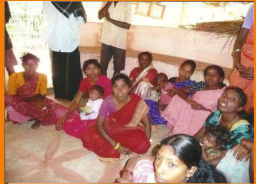
Self Help Group meeting

The community outreach team of DSI facilitate women self-help groups (SHGs) in villages especially in Irular community Block. Interactive Monthly meeting of villager women empower women with self-esteem, emotional strength and with the knowledge of legal rights, community health, nutrition and education of their children and so on. We aim at Sustainable development in the women and to have economically independence.