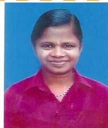
Poosanam (Diploma in Computer Application)