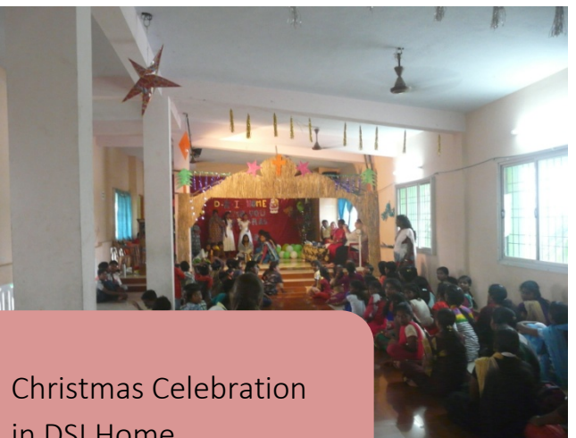
Christmas Celebration in DSI Home