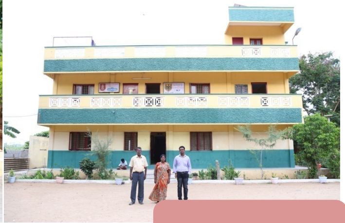
Boys' Home staff