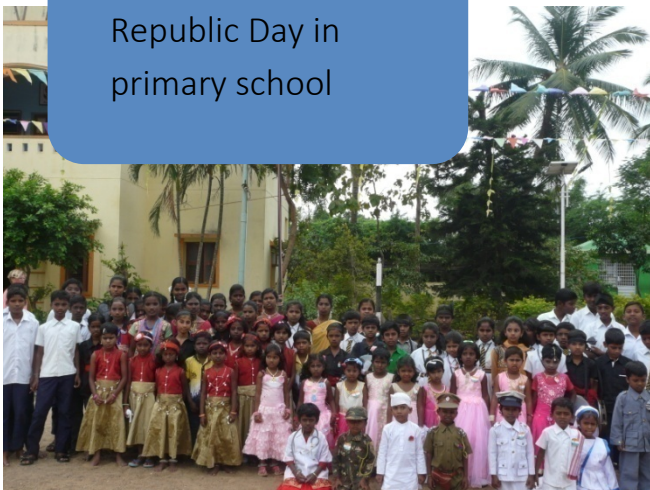
Republic Day in primary school

As every year, we had various celebrations: the Pongal and Republic Day in January, the National Day in August and Christmas in December. Along with the festive programmes with great singing and dancing performances, we also enjoyed special meals given to our home by our kind sponsors.