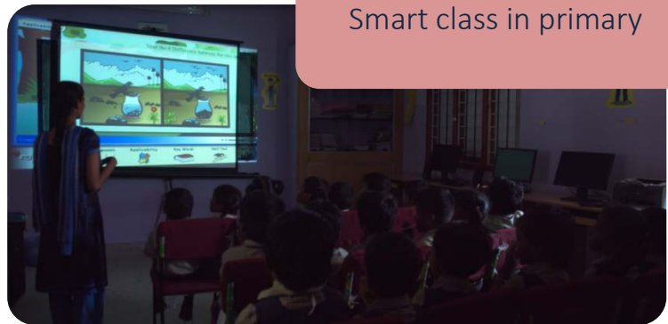
Smart class in primary