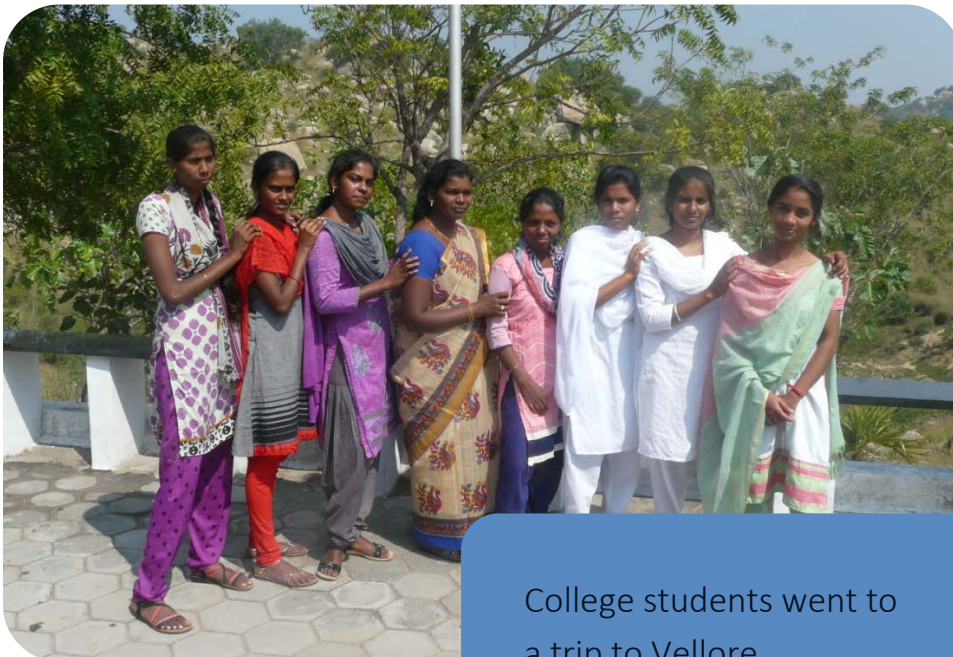
College students went to a trip to Vellore