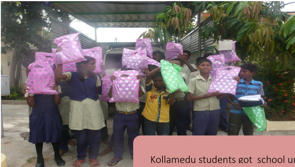
Kollamedu students got school uniforms