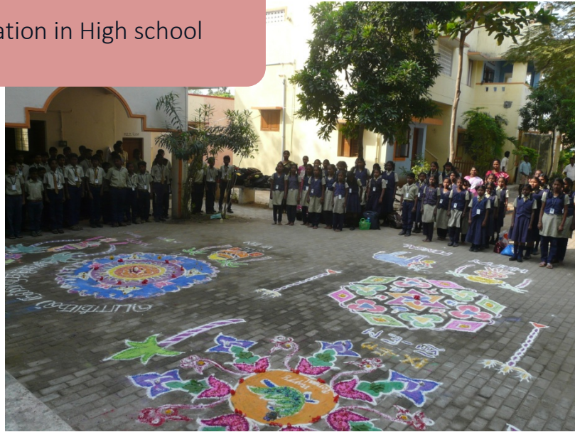
Pongal celebration in High school