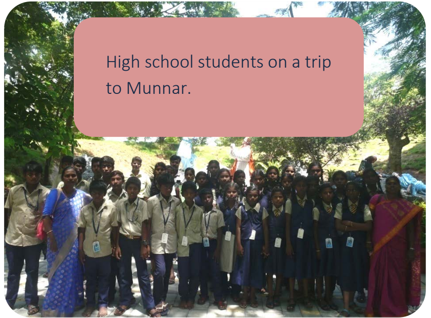
High school students on a trip to Munnar.

But not just children from our primary moved to the Hawischar Happy High school, in total we had 54 new admissions last year. Next to their normal classes, they will also have special abacus classes from which they will surely profit. We are especially happy about the 100% pass and 31 students finishing the tenth standard.