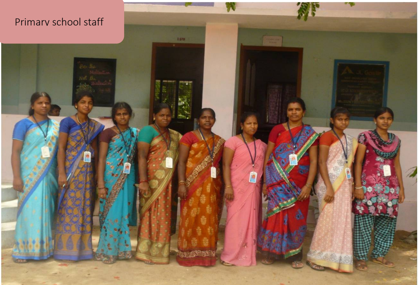
Primary school staff