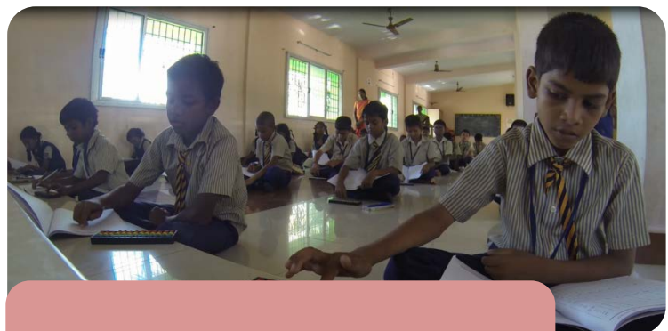
Abacus class in high school