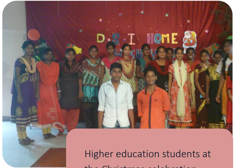
Higher education students at the Christmas celebration

After they finished their school, some children want to go to higher educational schools but need help to do so. We are proud to support around twenty girls and boys on their way to further education and therefore a better future. Six girls finished their college degree and are now moving on to work and start a family. We wish them the very best for their future!