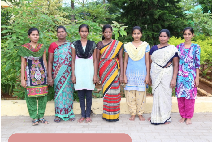
Girls' Home staff